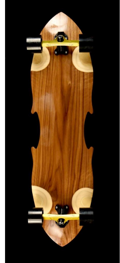
Gran Concerto No.8

Gran Concerto has no fear about speed, with L and XL sizes you can reach up to 100 km/h!