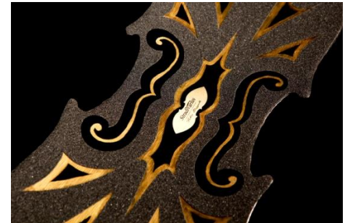
Gran Concerto No.7 (front)