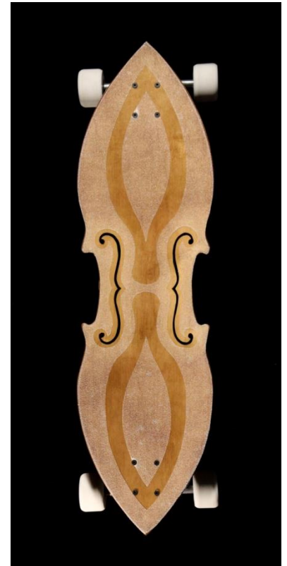
Gran Concerto No.1