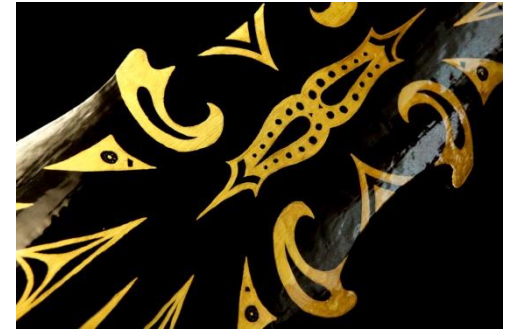
Gran Concerto No.7 (back)

Finally you can decide the finishing between a lot of precious wood, synthetic fibers, or an artwork painted by hand.